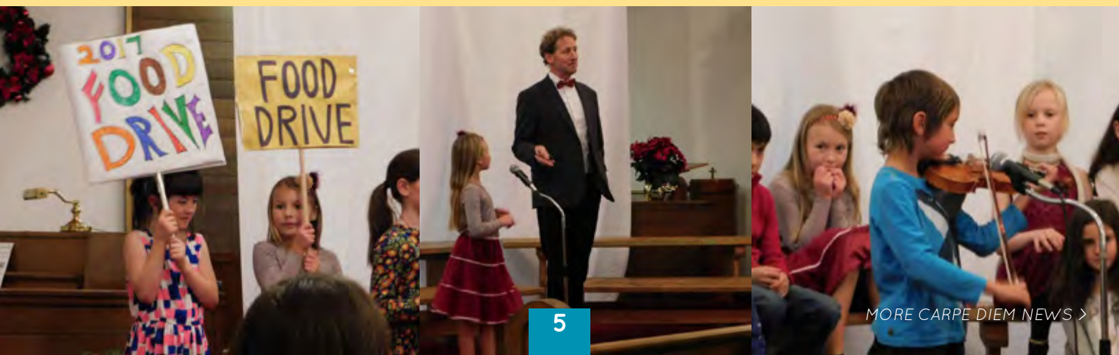
BELOW: Scenes from Winter Celebration on December 14.

We continue to play with naming the world around us. Our current focus is on food and expressing likes and dislikes. Here is a link to the food page on HUACHINANGO: http://huachinango.wikispaces.com/La+Comida