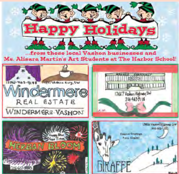
A few of the Beachcomber ads created by our students.