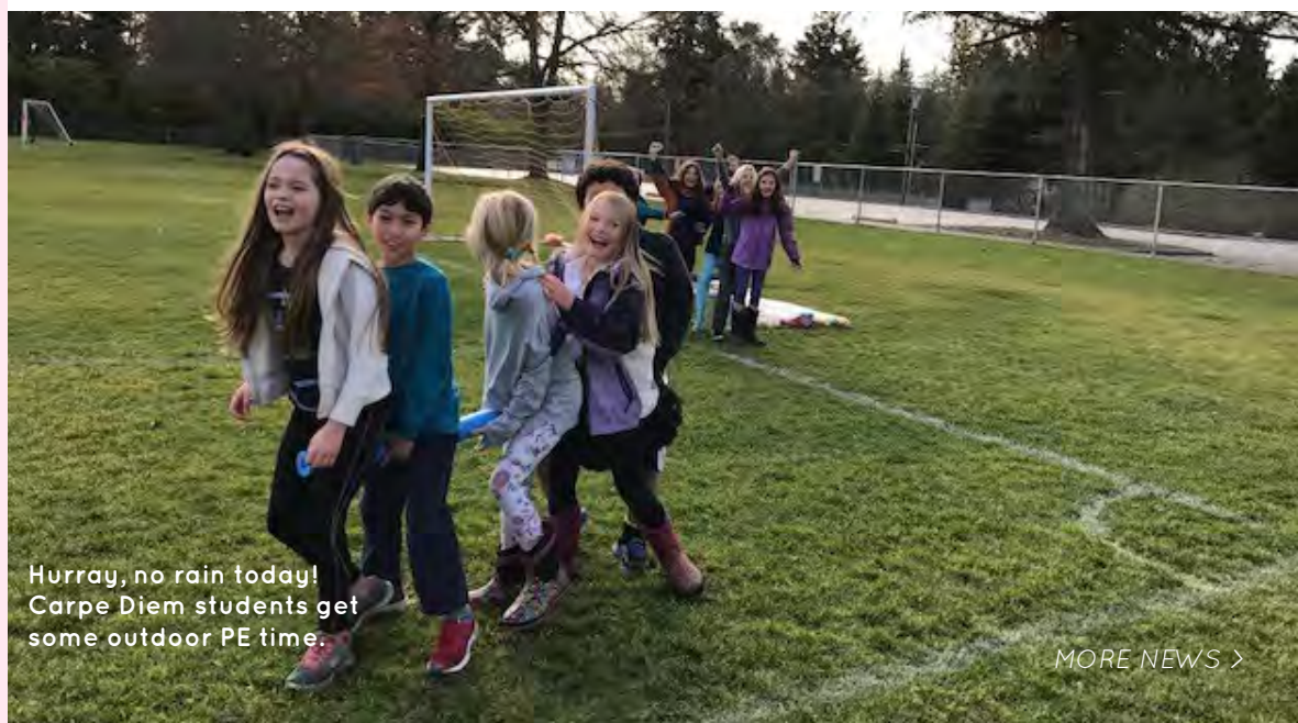
Hurray, no rain today! Carpe Diem students get some outdoor PE time.