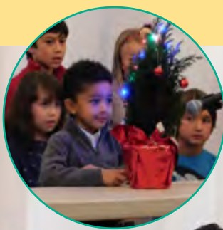
More snapshots of Winter Celebration.