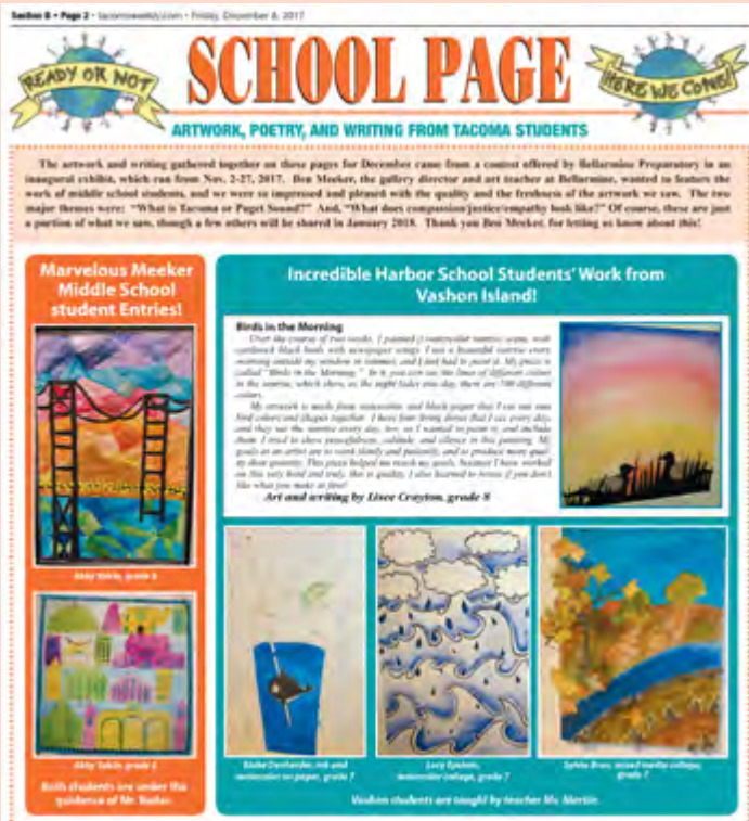
Student art reprinted in the Tacoma Weekly.