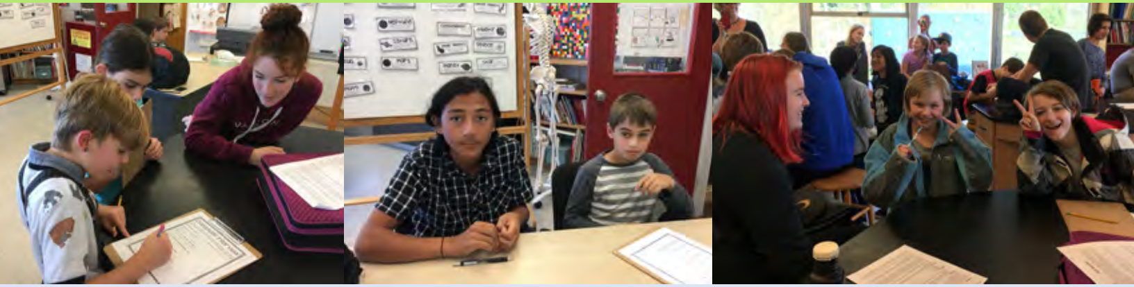
Upper Elementary students interviewing their 8 th grade buddies!